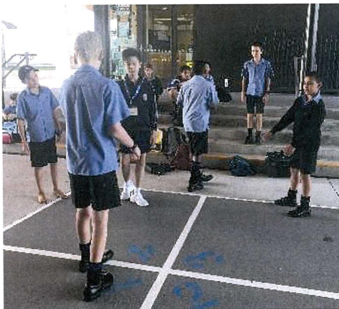
him. It was fun.